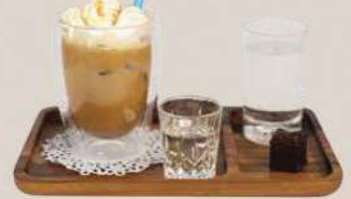
Iced Cappuccino 120