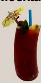
Virgin Mai Tai