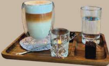
Hot Thai Tea 120