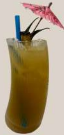
Pineapple Ginger Beer