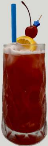
Sex On The Beach