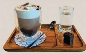
Hot Chocolate 120