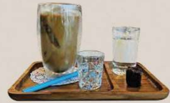
Iced espresso 120