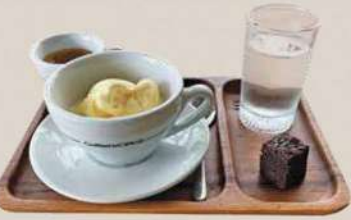
Affogato 190 Espresso served with Vanilla Ice Cream