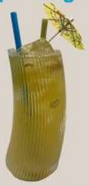
Lemongrass Jasmine Iced Tea