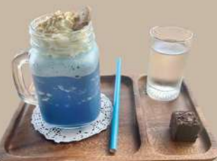
Frappe 120 Choice of Cappuccino, Mocha Caramel, Matcha Playa