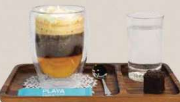
Irish Coffee 350 Espresso shot with Jameson's whisky