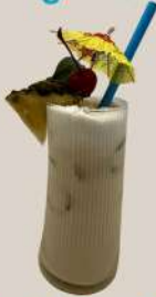
Virgin Pino Colada