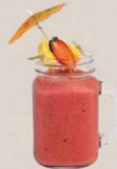
Strawberry & Banana