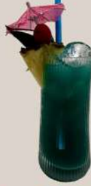
Playa Blue Lagoon