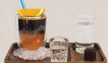
Orange Coffee 120