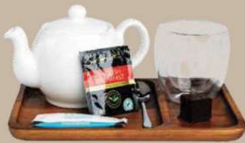
Hot Tea of Choice