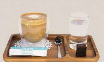
Flat White 120