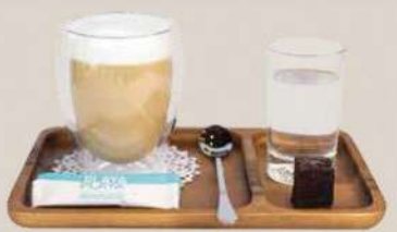
Latte Macchiato 120