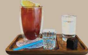
Iced Lemon Tea