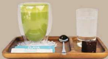
Hot Green Tea