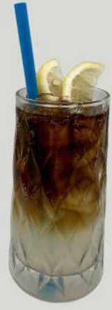
Long Island Ice Tea