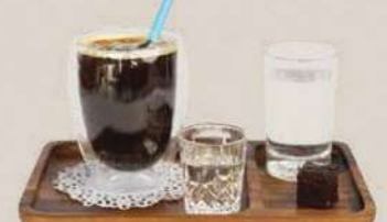
Iced Americano 120