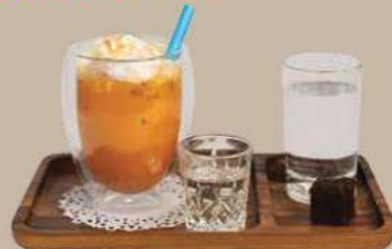
Iced Thai Tea