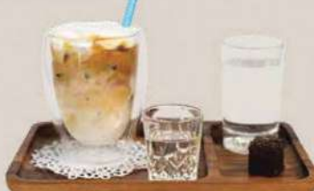
Iced Latte Macchiato 120