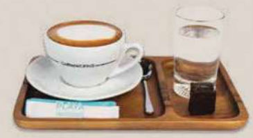
Italian Cappuccino 120