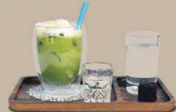
Iced Green Tea