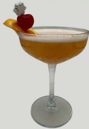
Costa Del Sol